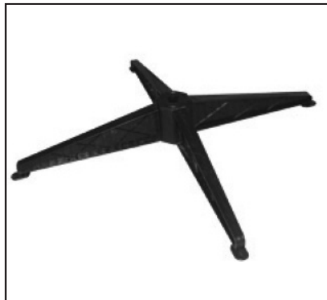
STEP 2 (Figure C)